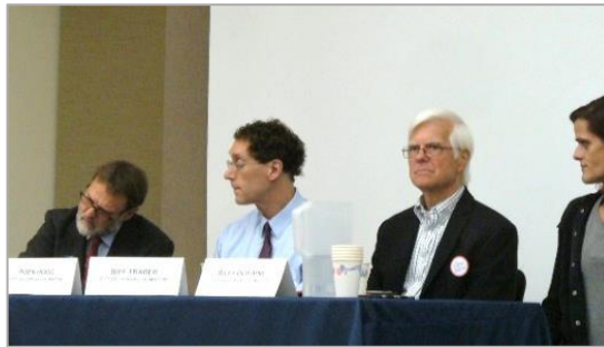
Candidates for Mayor of Corvallis